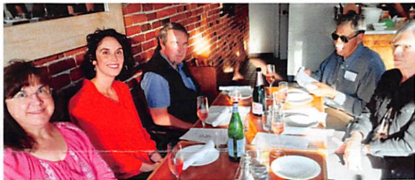
Committee members gathered to toast the Capital Campaign's success in late October.

wins, and learned from losses. It was my honor to help lead the team to victory!"